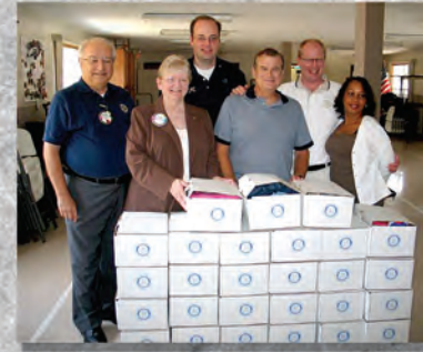
Shoe boxes filled with gifts for the children of the dump in Nicaragua.