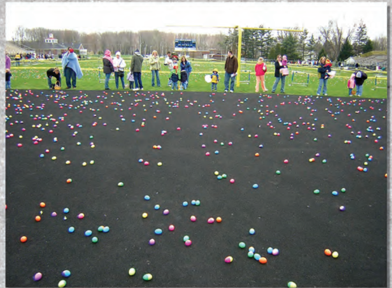
10,000 eggs were donated for the kids at our annual Easter egg hunt!