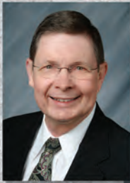
Photo at Left Retouched Photo Below Not Retouched

Make your first impression a positive one with a professionally created and retouched portrait. You'll be in and out of the studio in less than 30 minutes.