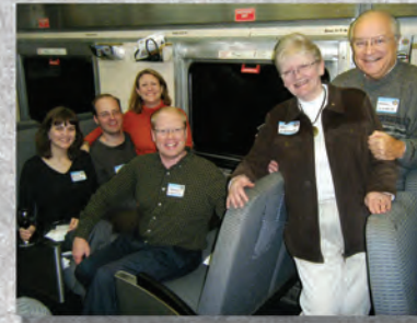
Several Rotarians aboard the wine train riding through Cuyahoga Valley National Park.